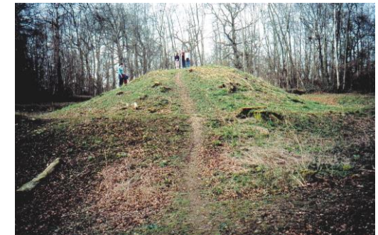
The c.4500 year old Bronze Age Barrow

Note the large mound on the north side of the path. This is a Bronze Age burial mound (a 'barrow') dating from around 2,500BC. It has been preserved from ploughing by being in a wood. Many others near the village have been ploughed flat.