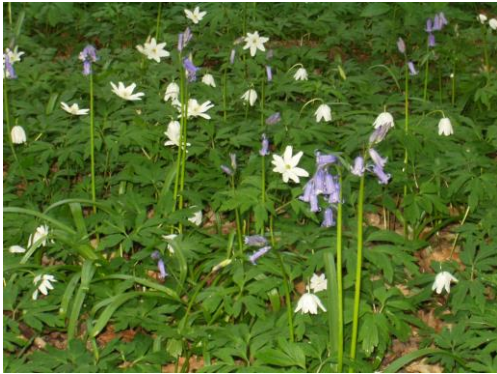
Wood anemones and bluebells

Footpath 11 and 11a runs uphill and along the crest of a steep slope falling to the north. This slope contains terraces that may have been formed by medieval farmers ploughing along the slope. The area at the NE end is particularly rich in Ancient Woodland Indicator Species of plants (AWIS) confirming that the wood has been here since at least 1600. AWIS are plants with very poor powers of seed dispersal. This means that once destroyed by cultivation they do not return and so their presence indicates centuries of undisturbed soils.