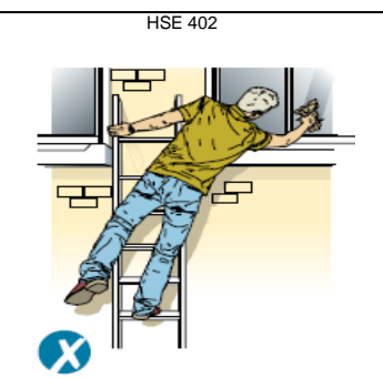
Figure 1a Incorrect - overreaching and not maintaining three points of contact