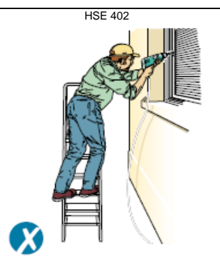
Figure 2a Incorrect - steps side-on to work activity