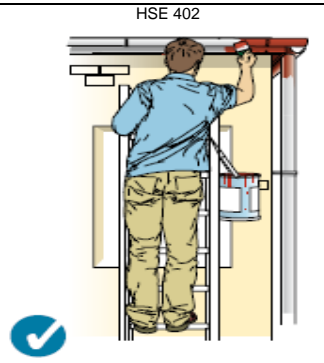
Figure 1b Correct - user maintaining three points of contact