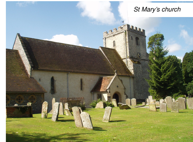
St Mary's church