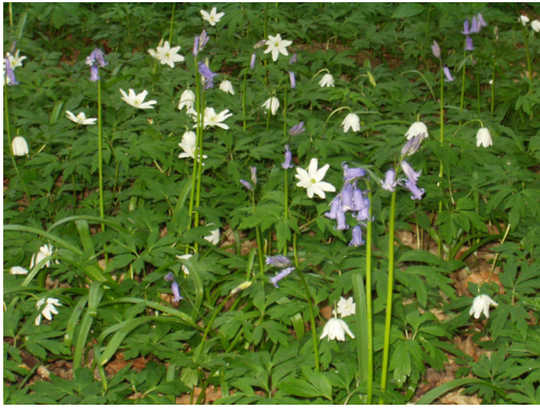
Wood anemones and bluebells

Footpath 11 and 11a runs uphill and along the crest of a steep slope falling to the north. This slope contains terraces that may have been formed by medieval farmers ploughing along the slope. The area at the NE end is particularly rich in Ancient Woodland Indicator Species of plants (AWIS) confirming that the wood has been here since at least 1600. AWIS are plants with very poor powers of seed dispersal. This means that once destroyed by cultivation they do not return and so their presence indicates centuries of undisturbed soils.