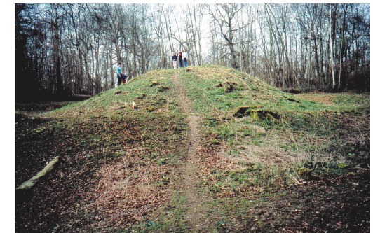
The c.4500 year old Bronze Age Barrow

Note the large mound on the north side of the path. This is a Bronze Age burial mound (a 'barrow') dating from around 2,500BC. It has been preserved from ploughing by being in a wood. Many others near the village have been ploughed flat.